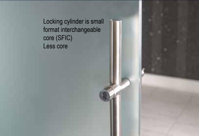
Locking cylinder is small format interchangeable core (SFIC) Less core