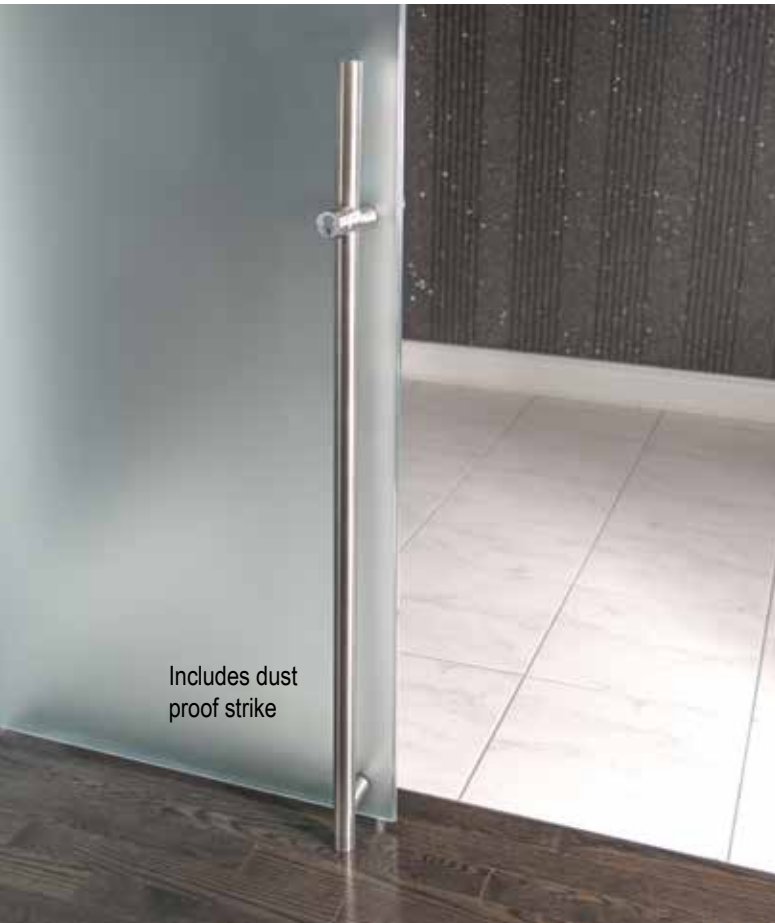
Includes dust proof strike