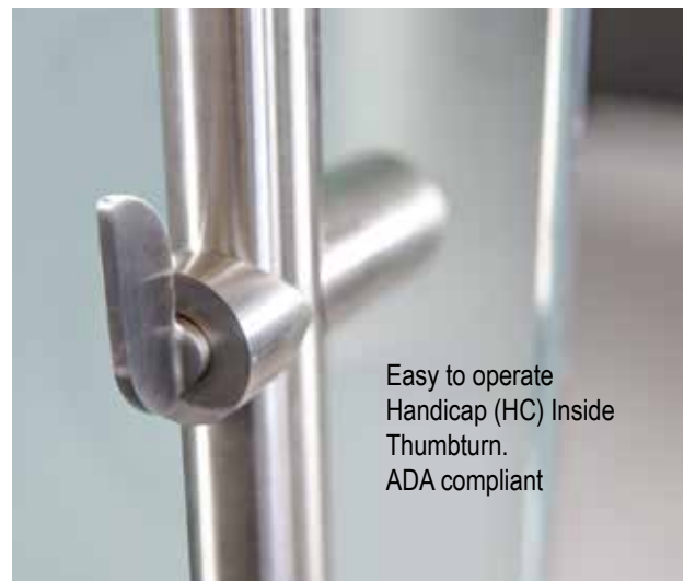
Easy to operate Handicap (HC) Inside Thumbturn. ADA compliant